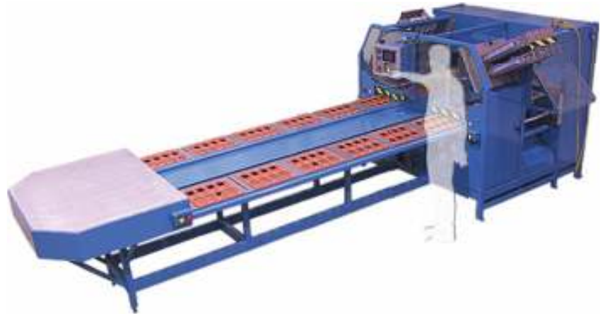
20 SC 1216 Carousel Shown with Optional Accessories

Our 20SC Series automated carousel type blister sealing machines are ideal for high volume or just in time production. The 20SC Series automated carousel sealing machines are built with the capability to feed blister(s), blister card(s) and discharge finished packages. With 12 open loading stations these machines are ideal for automated product loading or where multiple items are to be placed in a single package.